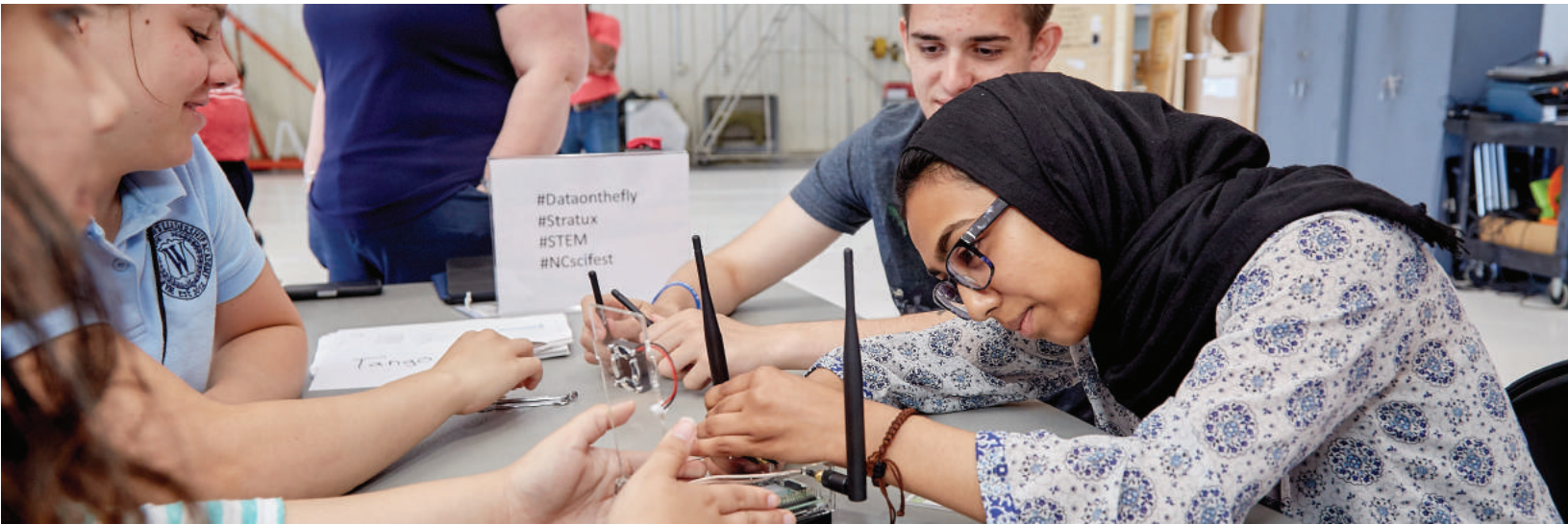
Copyright © 2017 SAS Institute Inc.

For the fifth consecutive year, Morehead proudly partnered with Live Nation and the Durham Performing Arts Center (DPAC) to bring Neil deGrasse Tyson to the Triangle. Before enthraling a sold out crowd, Tyson stopped by Morehead’s pre-party and spoke about the importance of planetariums. Tyson, a planetarium owner himself, believes field trips to planetariums are sometimes children’s first interaction with science and can inspire a love for STEM fields. We’re excited to continue our partnership with Neil deGrasse Tyson and hope he will continue to return to the Triangle.